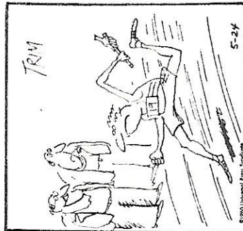
© 1988 Universal Amm. Systems 5-24