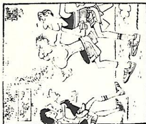
"ACTIVE SPORTSWEAR FOR GUYS - GALS & LITTLE PALS"

last Traffic light on South side of Town