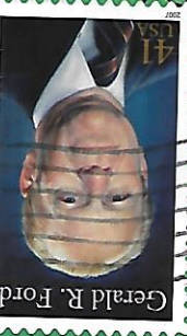
Gerald R. Ford