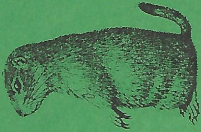
BLACKTAIL PRAIRIE DOG

WHEN: SATURDAY, MARCH 14, 1992 REGISTRATION 8:00-8:45 A.M. RACE START AT 9:00 A.M.